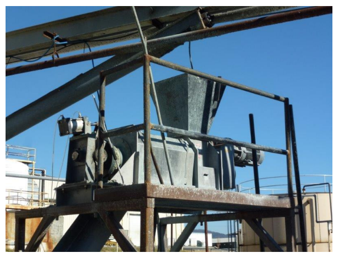
KP-10 at Plastics Recycler