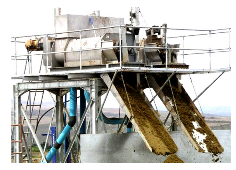
Dual KP-16s on Dairy Manure