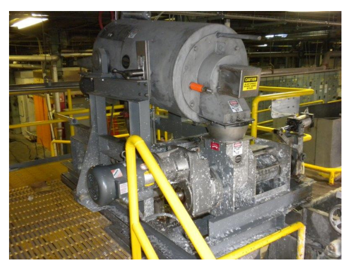
Fiber Filter as Pre-thickener to KP-10