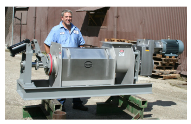
KP-10 Screw Press at Vincent