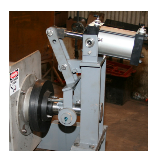
Air Cylinder Actuated Discharge Cone Controls Press Cake Moisture