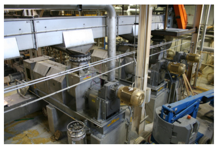
Trio of KP-24s on Corn Fiber