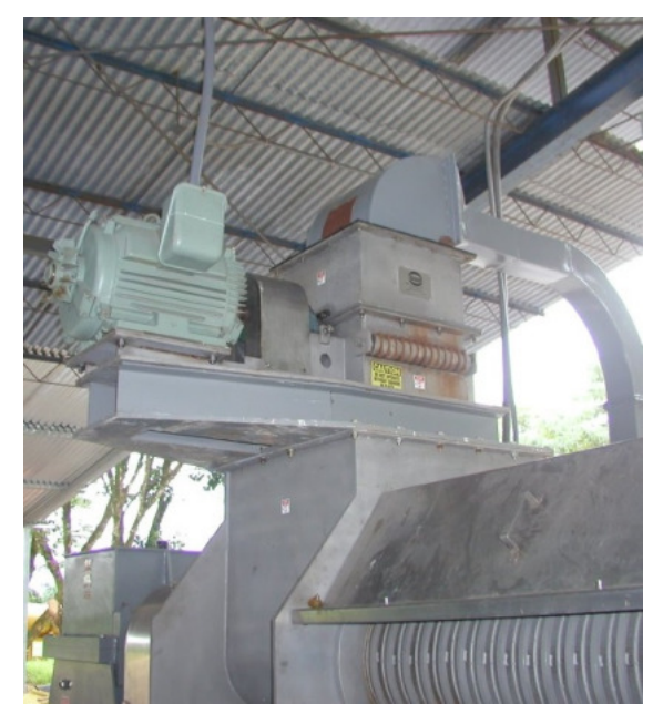
Shredder at Press Inlet