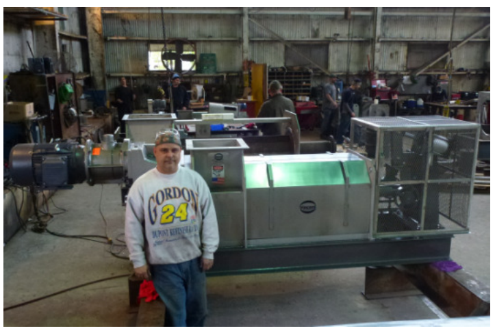
KP-12 with Safety Guarding