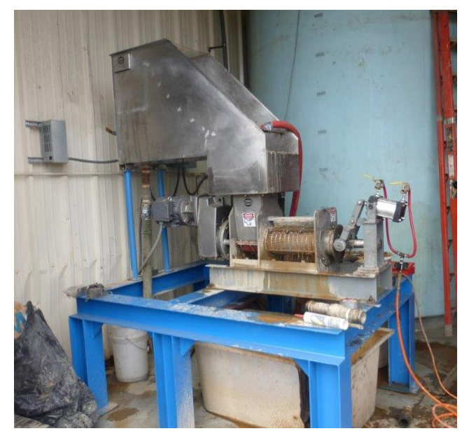
KP-6 Fed by Sidehill Screen