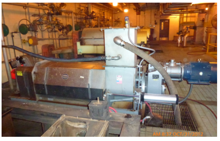
KP-16 with Level Sensor for Flow Control