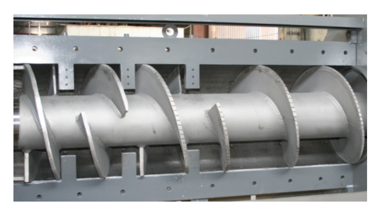
Interrupted Flighting, Graduated Pitch and Resistor Teeth for Maximum Dewatering